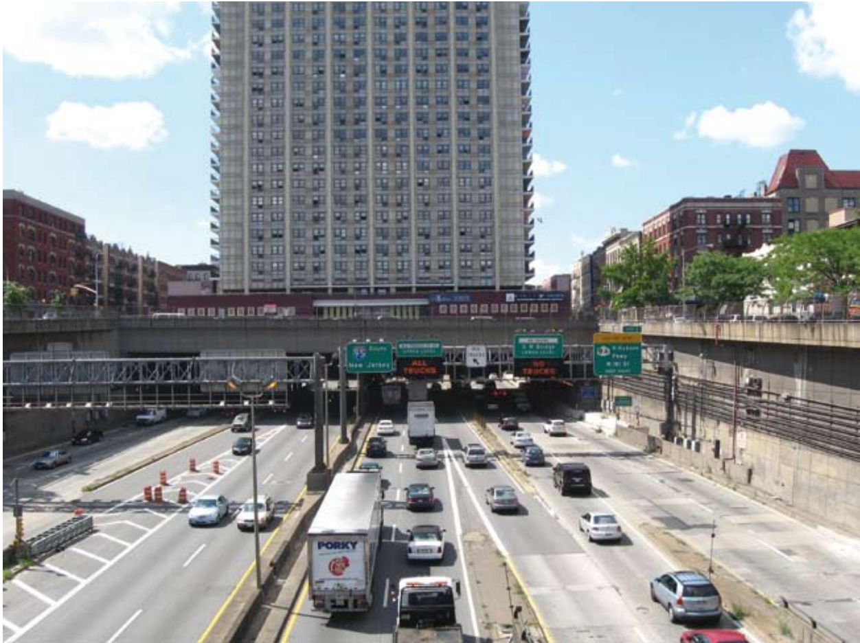
An apartment building has been built above the Trans-Manhattan Expressway in New York City. Living near a highway raises the risk of developing lung cancer, and of dying from stroke, lung disease and heart disease.

cough, wheezing, runny nose and asthma. 44 People living near highways or highly traveled roads face an increased risk of developing lung cancer, and a greater risk of death from stroke, lung disease and heart disease. 45 More than 11 million Americans live within 500 feet of a major highway. 46